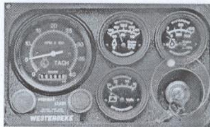
Optional Admiral Panel